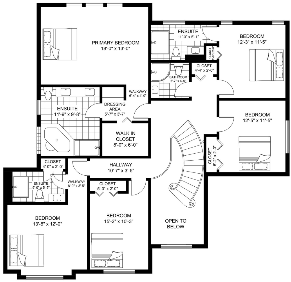
CEILING HEIGHT 8'-0" - 10'-0" UPPER FLOOR 1,682 SQ FT